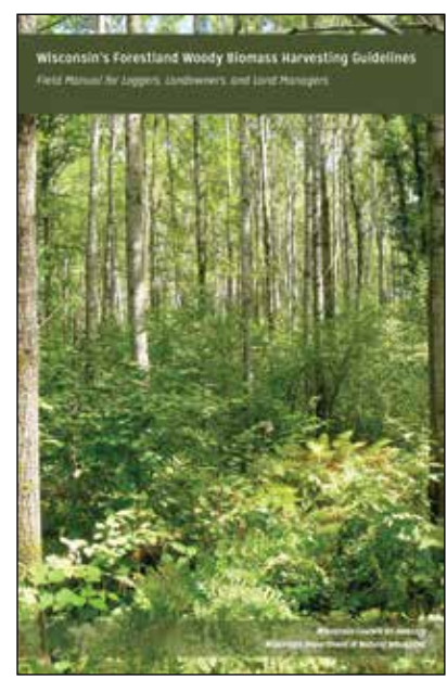
Wisconsin's Forestland Woody Biomass Harvesting Guidelines Field Manual; http:// www.wisconsinforestry.org/initiatives/other/ woody-biomass

A goal of the BHG's (guideline #5) is to retain at least 5 oven-dry tons per acre of fine woody debris ("FWD": material that is < 4" in diameter) on site following harvest. This target can be achieved by retaining down FWD already present on a site (before a harvest takes place), retaining FWD resulting from incidental breakage during a harvest, and retaining and scattering additional tree tops and limbs (recommended as 10%, or 1 in 10, of the harvested tops and limbs) in the harvest area if needed. However, forest resource managers, loggers, and other forest professionals have indicated uncertainty in identifying the amount of FWD remaining following a harvest and difficulty in determining whether the recommendation for retaining an additional 10% of the tops and limbs has been satisfied. The goal of this companion guide is to provide forest resource managers, loggers, equipment operators, contractors